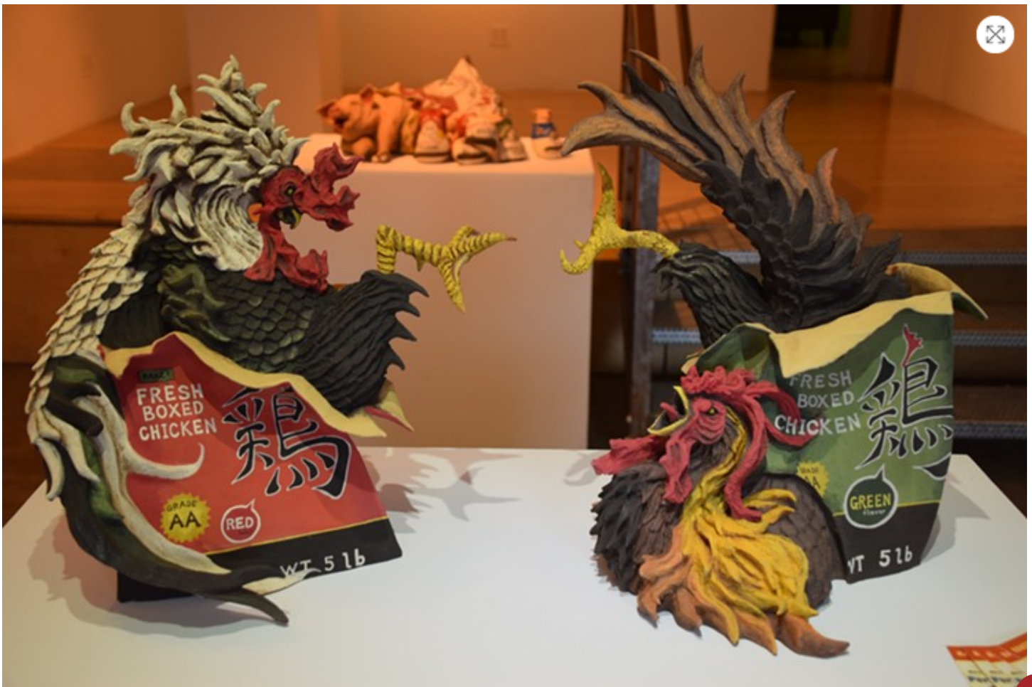
> Works by Kazuma Sambe, who explored quantity versus quality at Eye Lounge.