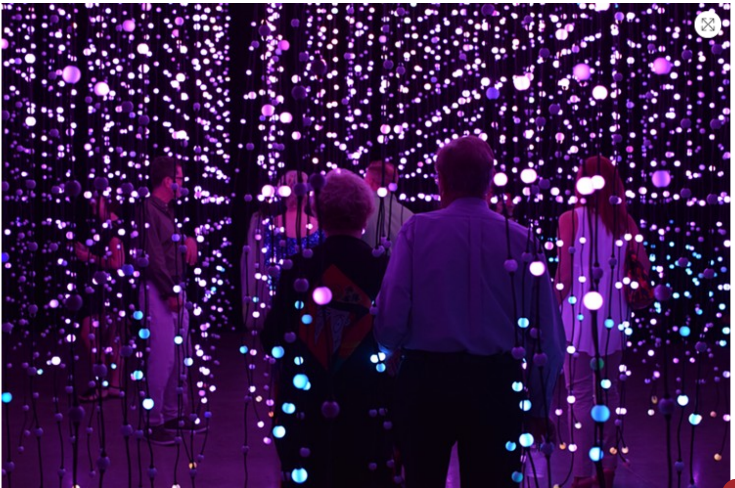
> Squidsoup installation at Scottsdale Museum of Contemporary Art.